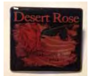
Lapel Pin $7