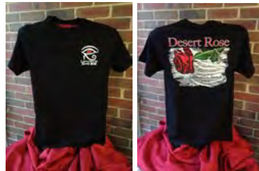
Front Back Desert Rose Show Shirt $18-$22